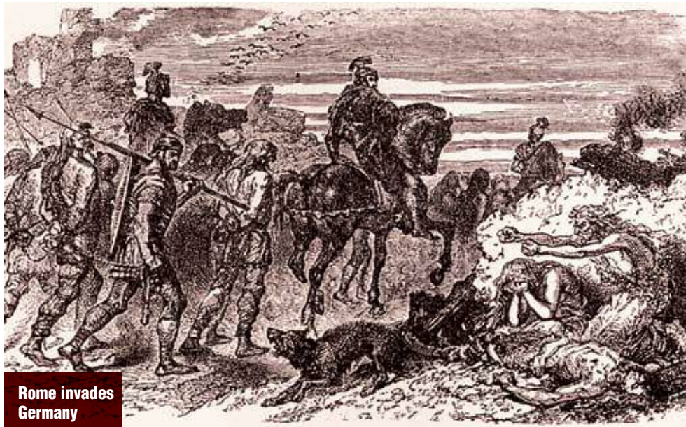
Rome invades Germany

Arminius (“Hermann the Liberator”) and his German warriors crushed three Roman legions in the Teutoburg Forest – and in so doing redirected the course of history.