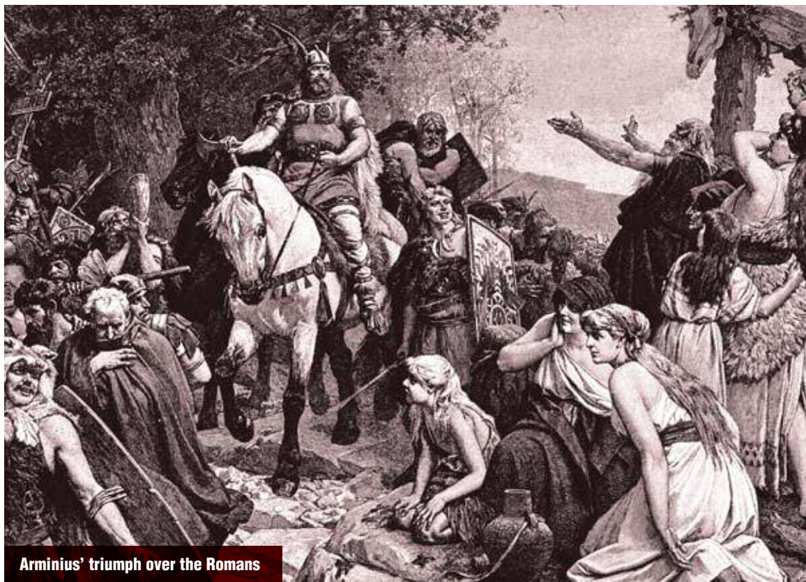
Arminius' triumph over the Romans

Some authorities believe the battle was over in an hour; others believe it stretched out over three days. Possibly the outcome was clear after the first hour, but skirmishing continued for three days as Roman survivors fought their way back to the Rhine. But this is clear: Arminius and his German warriors had won a resounding victory. Of the 15,000-20,000 Roman soldiers, fewer than 1,000 survived. German losses were about 500 dead, 1,500 wounded. News of the defeat caused consternation in Rome. Suetonius, in his Lives of the Twelve Caesars , wrote that Emperor Augustus banged his head against the palace walls, shouting Quintili Vare, legions redde! (“Quintilius Varus, give me back my legions!”) But rather than face the ignominy of defeat, Varus committed suicide after the battle. And the 17th, 18th, and 19th legions were never restructured, which is unique in Roman history.