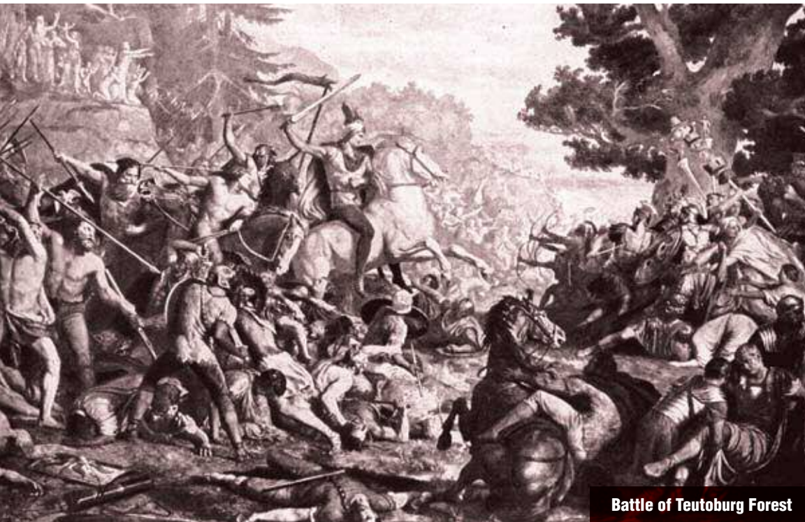
Battle of Teutoburg Forest