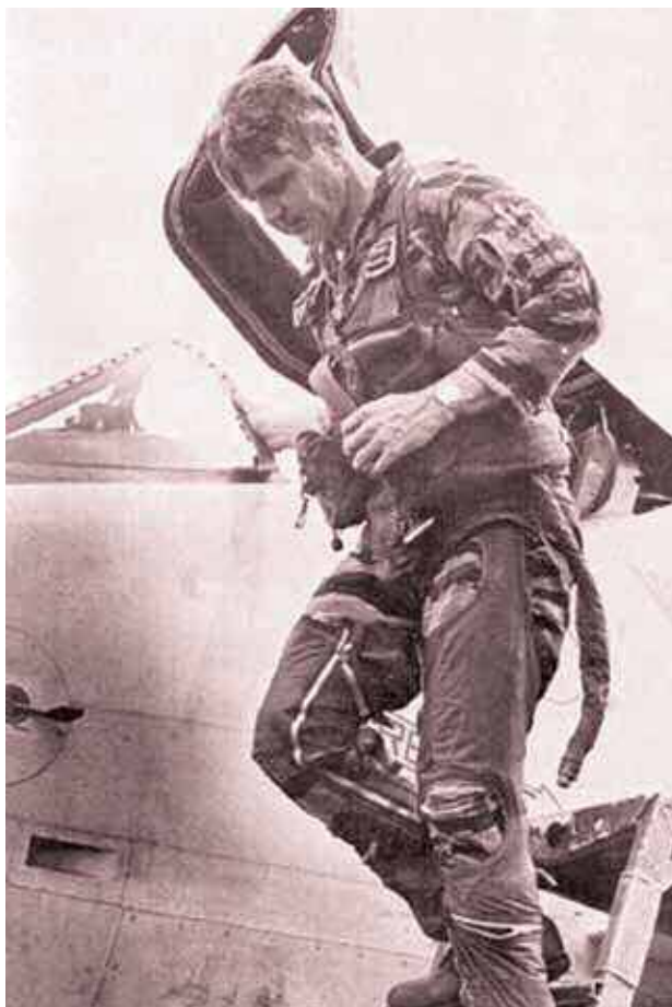
Pilot’s-eye view: James Stockdale, later a vice admiral, flew cover for U.S. ships on the night that North Vietnam supposedly attacked them. Stockdale couldn’t find a trace of an enemy that night.