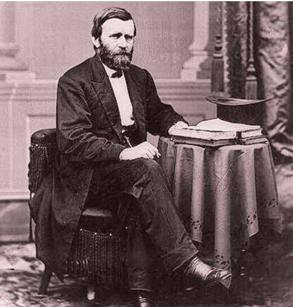
Success and failure: Ulysses S. Grant’s accomplishments for the Union in the War Between the States established him as one of history’s great war captains, but his eight-year Reconstruction-era presidential administration left a legacy of corruption and shame.

Dissatisfied with the response to their program from a crushed people now hu-