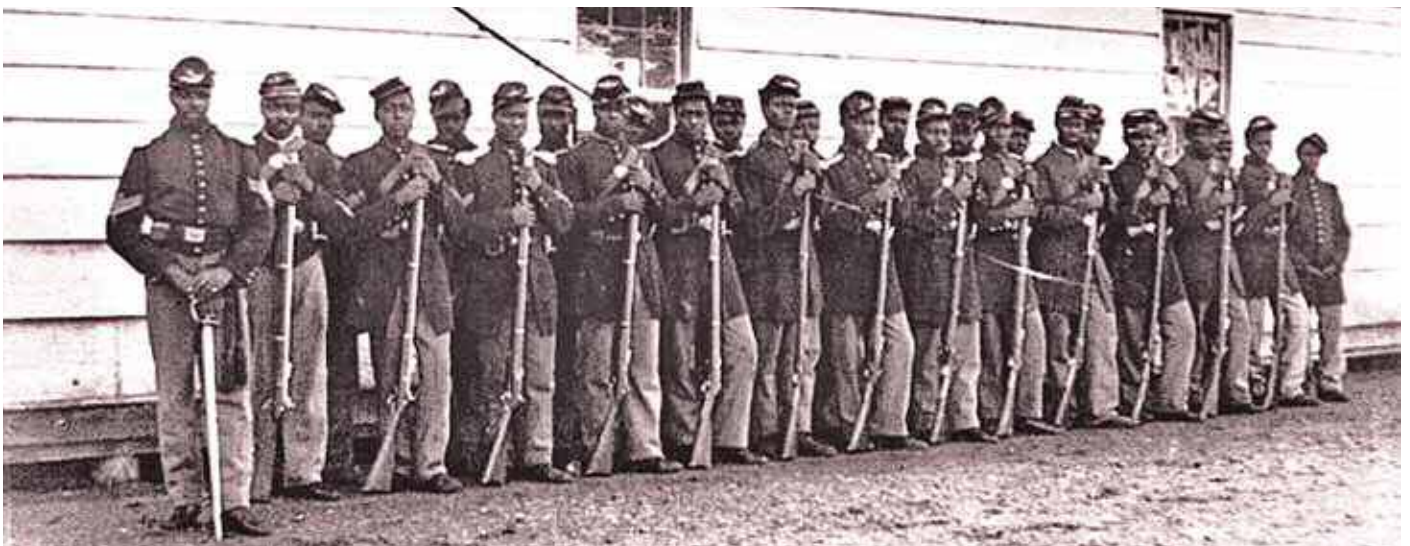
Off to slaughter: Lincoln was in favor of impressing into the Union Army blacks from Southern territories. Blacks who did fight suffered atrocious losses. Over one-third of the 186,000 blacks in the Union Army died before the war's end. Ironically, blacks also served in the Confederacy.

Make Negroes politically and socially our equals? My own feelings will not admit of this. I will say that I am not nor ever have been in favor of bringing about in any way