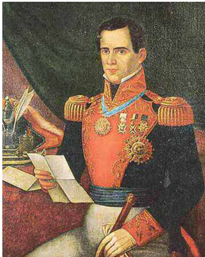
Calling himself the “Napoleon of the West,” Antonio López de Santa Anna was a brutal dictator who believed the people of Mexico needed despotism. His implementation of a military dictatorship caused an independence movement in Texas among both the American immigrants and the ethnic Mexican community.

Santa Anna traveled north, determined to crush the rebellion. Styling himself the “Napoleon of the West,” he succeeded in re-taking the Alamo (which Texian forces under Jim Bowie had wrested earlier from a small Mexican garrison), and killing all of its defenders, including the famed trio of William Barrett Travis, David Crockett, and Jim Bowie. It took