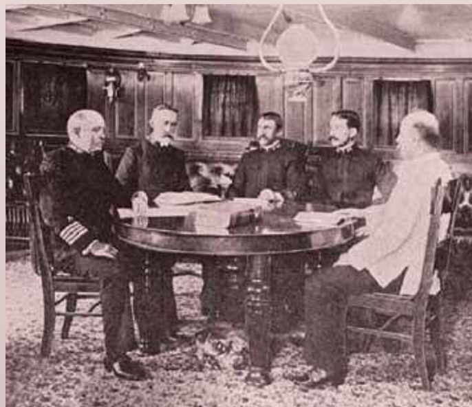
The original Naval Court of Inquiry that investigated the sinking of the Maine . It was headed by Captain William T. Sampson, seated second from the left.

someone used the cover of darkness to float an external mine to the Maine . Who had motive? Spain’s actions and internal documents prove it wished to avoid war at all costs. The primary beneficiaries were the Wall Street establishment and Cuba’s revolutionaries. The latter were using dynamite to destroy trains and bridges. They surely knew that if the ship met disaster, America would likely win their war. In Who Sank the Maine? historian Thomas Fleming noted that 50 to 100 pounds of dynamite, exploding externally, could have sufficed to detonate the Maine ’s munitions. ■