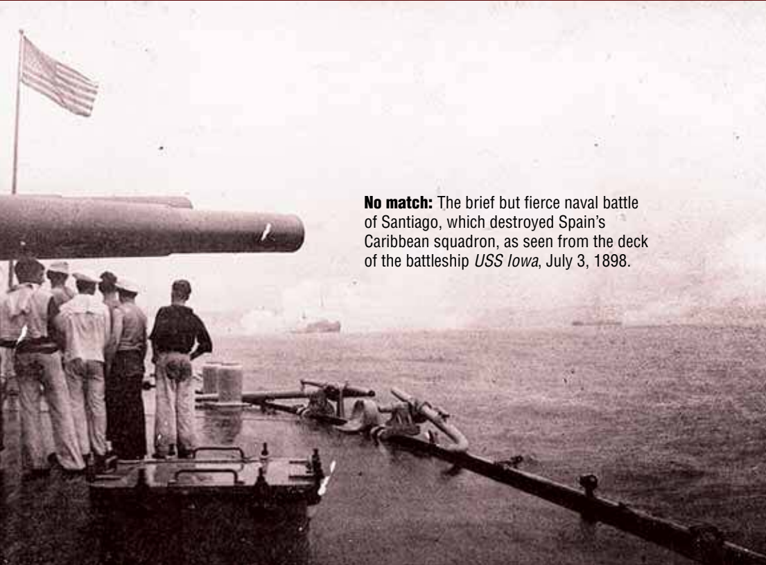
No match: The brief but fierce naval battle of Santiago, which destroyed Spain's Caribbean squadron, as seen from the deck of the battleship USS Iowa , July 3, 1898.

it basis — as compensation. In July, the United States also annexed Hawaii — though not a Spanish colony, it was absorbed during “expansion fever.”