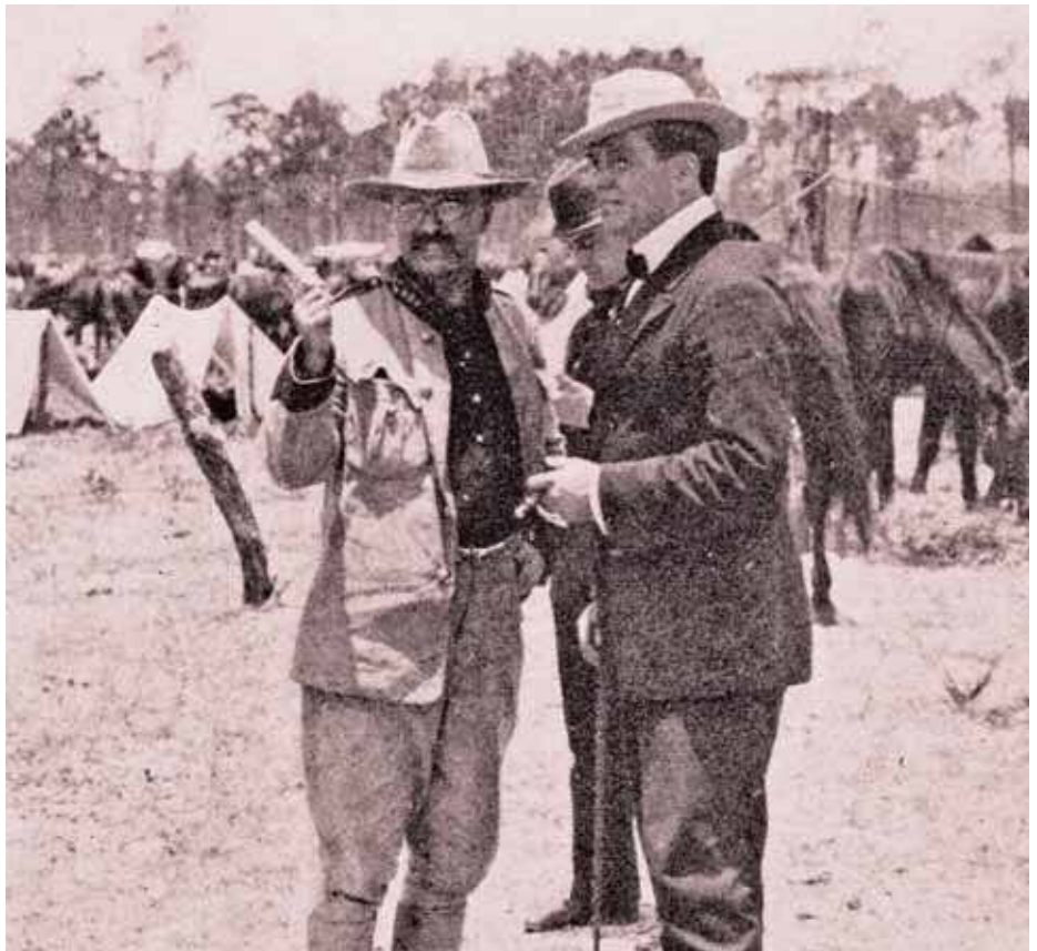
Charging forward: Teddy Roosevelt in Cuba with his friend, newspaper reporter Richard Harding Davis, whose reports of Roosevelt’s exploits helped propel his political career. Eighty-nine reporters arrived with U.S. troops who landed near Santiago.