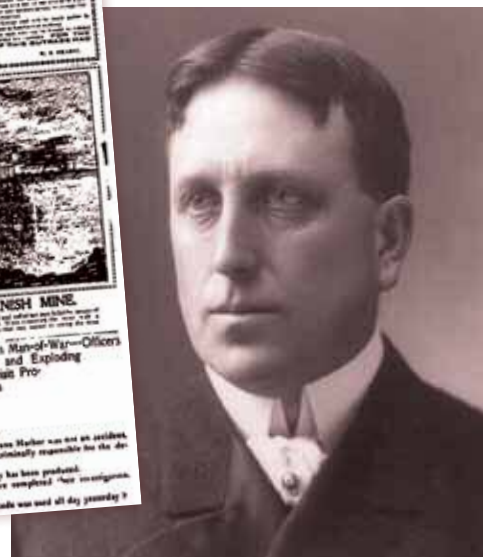
William Randolph Hearst , publisher of the New York Journal , pushed incessantly for war with Spain. To the left: the Journal two days after the Maine exploded. When the Naval Court of Inquiry declined to blame Spain, the newspaper rendered its own verdict.