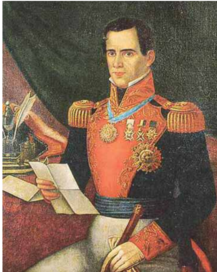
Calling himself the “Napoleon of the West,” Antonio López de Santa Anna was a brutal dictator who believed the people of Mexico needed despotism. His implementation of a military dictatorship caused an independence movement in Texas among both the American immigrants and the ethnic Mexican community.

Santa Anna traveled north, determined to crush the rebellion. Styling himself the “Napoleon of the West,” he succeeded in re-taking the Alamo (which Texian forces under Jim Bowie had wrested earlier from a small Mexican garrison), and killing all of its defenders, including the famed trio of William Barrett Travis, David Crockett, and Jim Bowie. It took