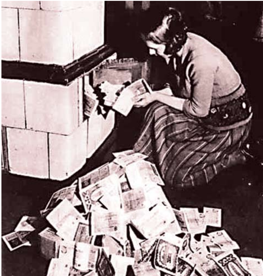
Its real value: This German woman literally burns money in the wake of the unwise decision by the German government to print huge amounts of money to pay that country's debts after WWI. The inflationary measure was soon taken to the point where the currency became virtually worthless.

Choked by an Allied blockade that threatened starvation at home, and battling a loss of confidence in Kaiser Wilhelm II, the army readied itself for defeat. In order to deflect responsibility for defeat, army leaders handed over power to a civilian government under Prince Max von Baden in October 1918. The beginning of the end came when the German naval command, as part of a last-ditch effort, ordered the fleet at Wilhelmshaven