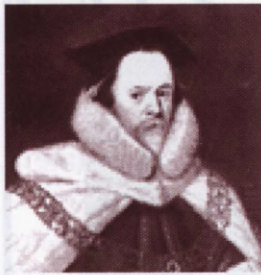
Sir Edward Coke Portrait