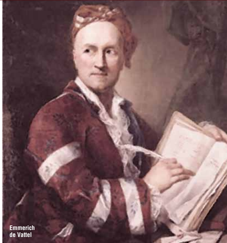
Emmerich de Vattel

and more accessible volume was a vigorous analysis of one of the foundational maxims of American political philosophy: that all men are created equal.