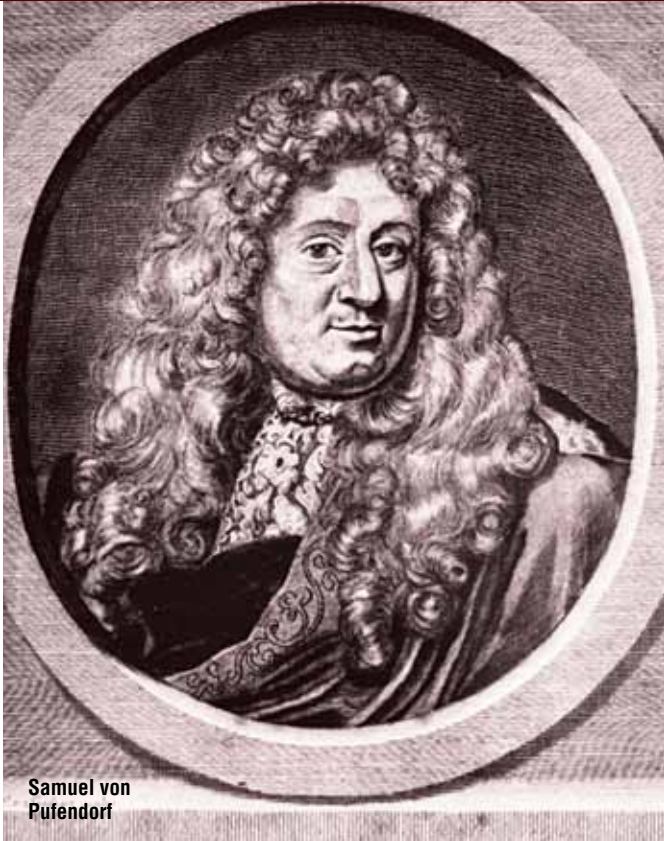
Samuel von Pufendorf