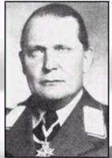
Hermann Goering, Hitler's Reich-Marshal at the Nuremberg Trials after WWII

"Naturally, the common people don't want war, but after all, it is the leaders of a country who determine the policy, and it is always a simple matter to drag people along whether it is a democracy, or a fascist dictatorship, or a parliament, or a communist dictatorship. Voice or no voice, the people can always be brought to the bidding of the leaders. This is easy. All you have to do is to tell them they are being attacked, and denounce the pacifists for lack of patriotism and exposing the country to danger. It works the same in every country."