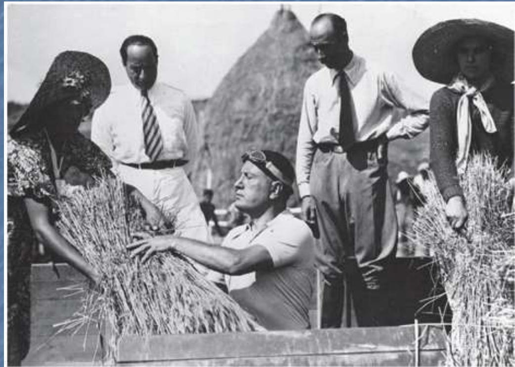
Benito Mussolini, surrounded by peasants, participates in the wheat harvest in Littoria, Italy.