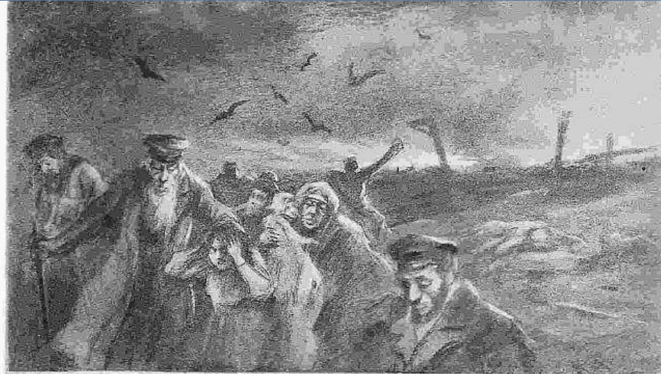
К. Фильковичъ. Погромъ.