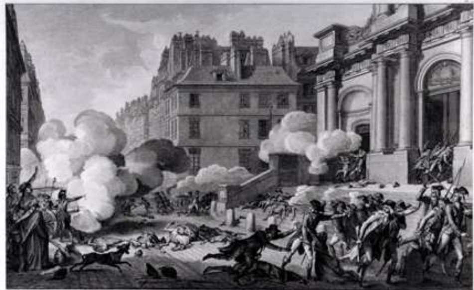
Journée du XIII Vendémiaire, l'an II. Culot, S. P. Rich, rue Drouot. Paris chez Bouchon, rue de la Harpe, vis-à-vis l'Hôtel de Soubise. 1795.